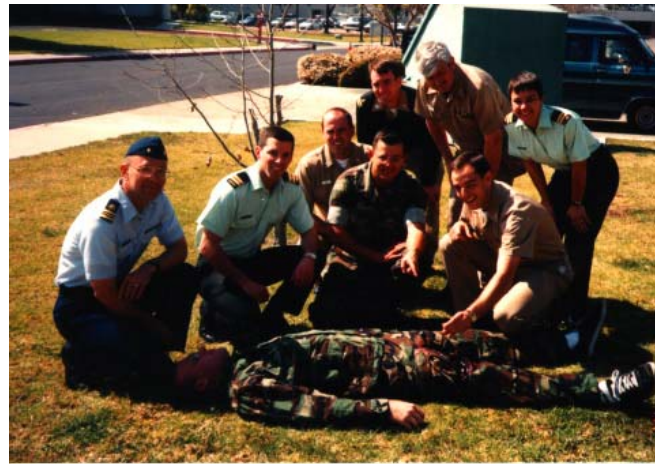
CFDS candidates and their USN and USPHS colleagues